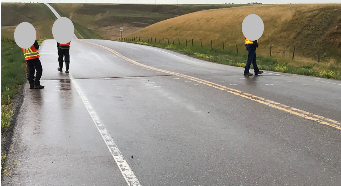
Photo 2 Full pavement depth transverse crack at the dip. Crack is up to 2 cm wide. White circles denote survey pins installed in a grid pattern. Photo was taken facing north on July 8, 2021.