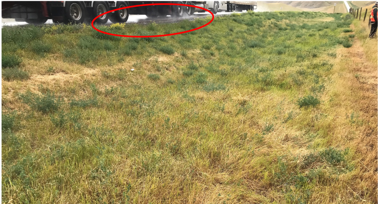
Photo 4 Fence line and embankment slope on east side of highway. Photo was taken facing north on July 8, 2021.