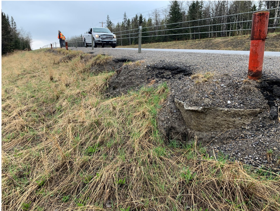
Photo 4 Settlement downslope of pile wall. Photo taken facing south on May 9, 2023.