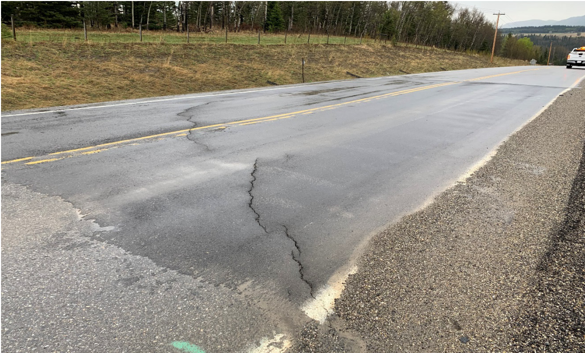
Photo 2 South end of pile wall. No slope movement noted. Photo taken facing north on May 9, 2023.