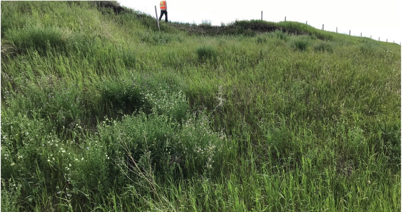
Photo 2 Toe rolls coalescing and blocking the ditch. Photo was taken facing west on July 8, 2021.