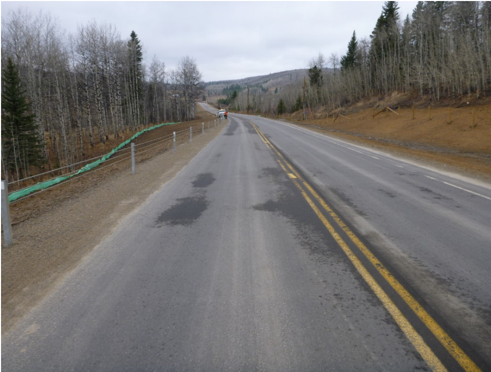
Photo 2 West embankment of highway. Photo taken facing northeast on April 30, 2018.