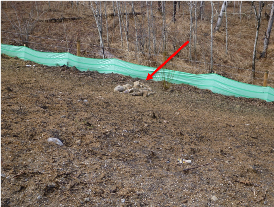
Photo 4 East side of highway ditch. Some erosion noted. Rolled erosion control product not used on ditch bottom. Vegetation not established on slopes. Photo taken facing northeast on April 30, 2018.