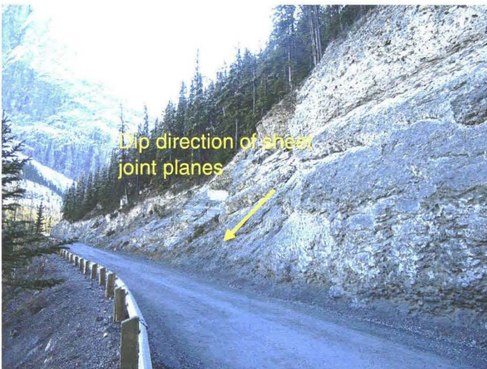
Photo 742-28 (middle) – Another view of a typical cut slope around Km 5.55. This cut slope is around 10 to 12 m high without a ditch along the toe. The adjacent road surface is approximately 6 m wide. There appeared to be relatively little rockfall in this area, with gravel and occasional cobbles along the toe of the cut slope. It appeared that the cut slopes in this area appear to be undergoing solution weathering with the exposed limestone slowly dissolving over time when wet from rain or snowmelt.