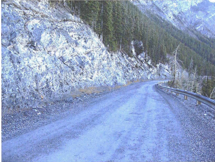
Photo 742-35 (top) – Typical view of the cut slopes around Km 5.8, a short distance northbound from the curve in the road. Note the accumulation of gravel and cobble-sized rocks along the toe of the cut slope. The cut slopes in this area also appeared to be primarily undergoing solution weathering, with relatively minor volumes of resulting rockfall.