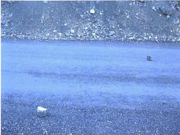
Photo 742-24 (top) – Another view of cobbles eroded out from the cut slope that have rolled out onto the road between ~Km 5.2 and ~Km 5.5.