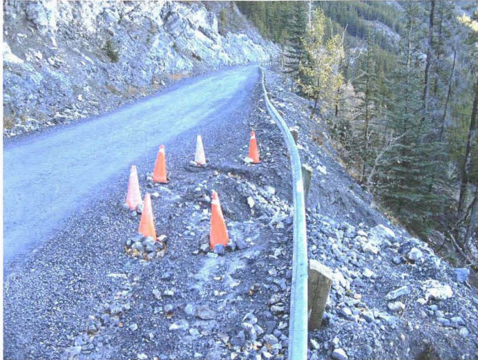
Photo 742-32 (top) – At ~Km 5.7, gully erosion in the fill slope below the road that has encroached below the guardrail and reduced the trafficable width of the road. Debris from plowing and grading the road surface has built up below the guardrail in the segment of the highway upslope /southbound from this location and has caused a concentration of surface runoff to discharge onto the fill slope below the road at this location, which has led to the gully erosion.