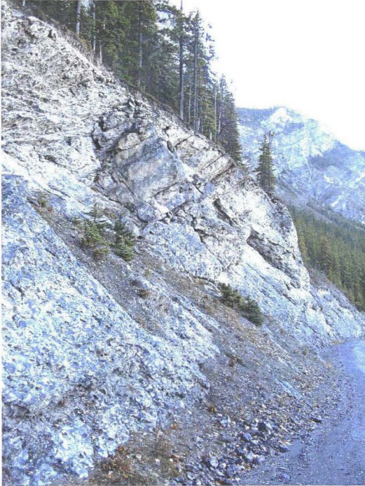
Photo 742-30 (top) – Another view of the location at ~Km 5.6 where a number of boulder-sized rocks appear to be close to breaking loose and sliding down onto the road.