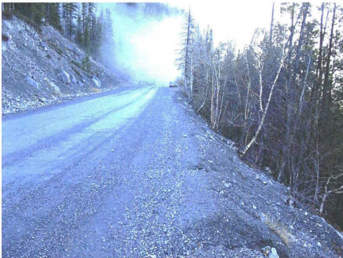
Photo 742-25 (middle) – Facing northbound along the segment of the highway between ~Km 5.2 and ~Km 5.5. Note the narrow road width and lack of guardrail along the downslope side.