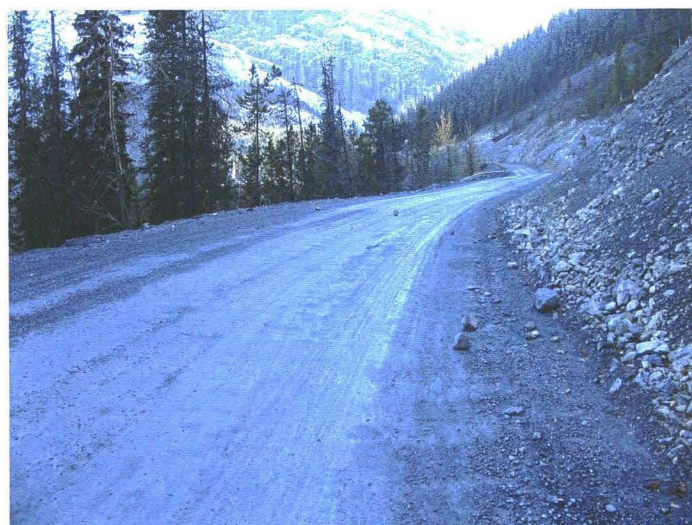
Photo 742-23 (bottom) – Facing southbound along the highway between Km 5.2 and Km 5.5. Note the cobble-sized rocks that have rolled out from the toe of the cut slope and onto the road surface. It is likely that other rocks have rolled out onto the road at other times and have been cleared to the edge by the maintenance contractor.

Photo 742-22 (middle) – Typical cut slope between Km 5.2 and Km 5.5, roughly 6 to 8 m high at up to 45° inclination. There is no ditch along the toe of the slope, and rocks that erode out from the cut slope may roll onto the road surface.