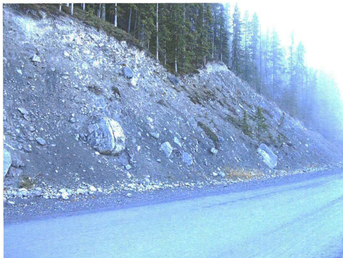
Photo 742-22 (middle) – Typical cut slope between Km 5.2 and Km 5.5, roughly 6 to 8 m high at up to 45° inclination. There is no ditch along the toe of the slope, and rocks that erode out from the cut slope may roll onto the road surface.

Photo 742-21 (top) – Typical view facing southbound along the segment of the highway between ~Km 5.2 and ~Km 5.5. Note the lack of upslope road ditch along the toe of the approximately 45° cut slope exposing rocky soil. Note also the lack of guardrail along the downslope edge of the narrow road.