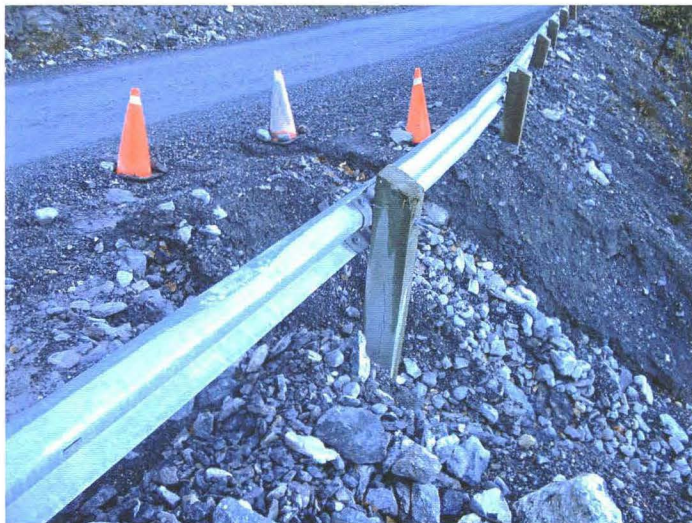
Photo 742-34 (bottom) – Another view of the head of the gully erosion, showing how the guardrail posts have been undermined.