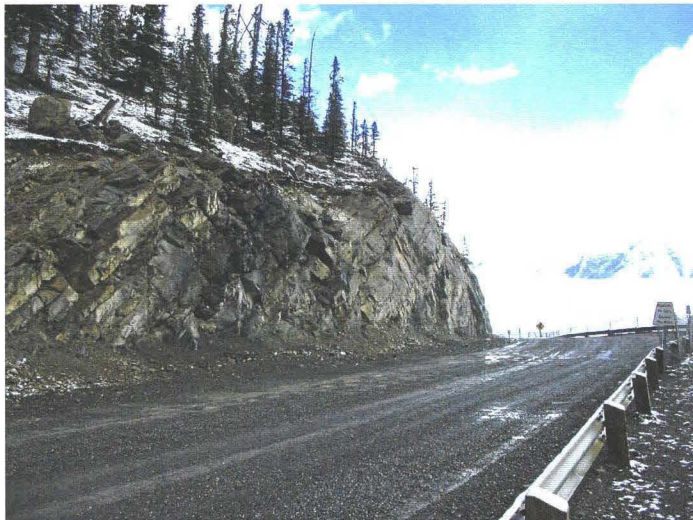
Photo 742-36 (middle) – Typical view of the cut slopes between ~Km 5.8 and ~Km 6.1. The cut slopes along this segment are typically around 50 to 55° inclination and 5 m or less in height. The cut slopes face southeast, therefore the southwest dip direction of the bedrock exposed in the cut slopes is roughly parallel to the bearing of the highway. This is less favorable with respect to slope stability than along the segment between ~Km 5.5 and ~Km 5.8 where bedrock dip direction is downwards into the cut slopes, however not a significant risk to this segment of the highway.

Photo 742-35 (top) – Typical view of the cut slopes around Km 5.8, a short distance northbound from the curve in the road. Note the accumulation of gravel and cobble-sized rocks along the toe of the cut slope. The cut slopes in this area also appeared to be primarily undergoing solution weathering, with relatively minor volumes of resulting rockfall.