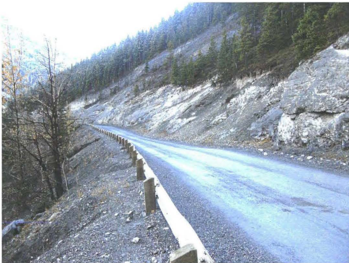
Photo 742-26 (bottom) – Facing southbound from around Km 5.5. The cut slopes expose bedrock from around this point southwards. There is also a guardrail along this segment of the highway.