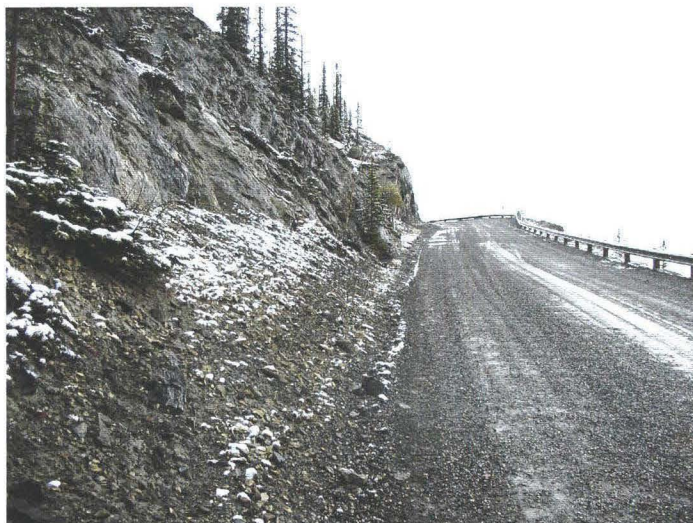
Photo 742-37 (bottom) – Typical view facing northbound towards the sharp bend in the highway around Km 5.8. Note the accumulation of gravel-sized debris along the lower part of the cut slope in some areas. Erosion and minor rockfall appear to be ongoing along this segment of the highway, but not a significant risk.

Photo 742-36 (middle) – Typical view of the cut slopes between ~Km 5.8 and ~Km 6.1. The cut slopes along this segment are typically around 50 to 55° inclination and 5 m or less in height. The cut slopes face southeast, therefore the southwest dip direction of the bedrock exposed in the cut slopes is roughly parallel to the bearing of the highway. This is less favorable with respect to slope stability than along the segment between ~Km 5.5 and ~Km 5.8 where bedrock dip direction is downwards into the cut slopes, however not a significant risk to this segment of the highway.