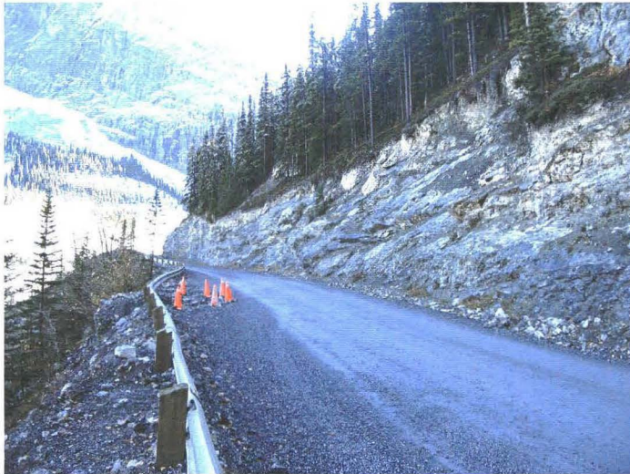
Photo 742-33 (middle) – Facing southbound towards the gully erosion and illustrating the reduction in road width adjacent to the gully.