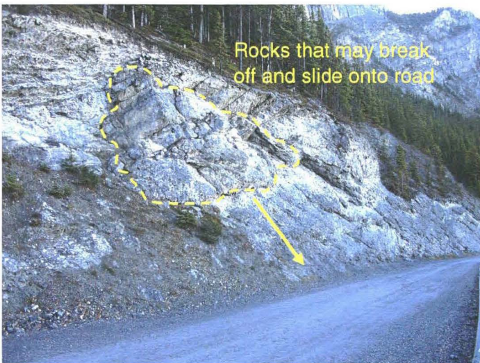
Photo 742-29 (bottom) – Rockfall/rockslide hazard at ~Km 5.6 from a number of boulder-sized rocks that appear to be close to breaking off the cut slope face and sliding down the sheet joint plane and onto the road surface. This location had been previously marked by others with orange paint near the middle of the slope.