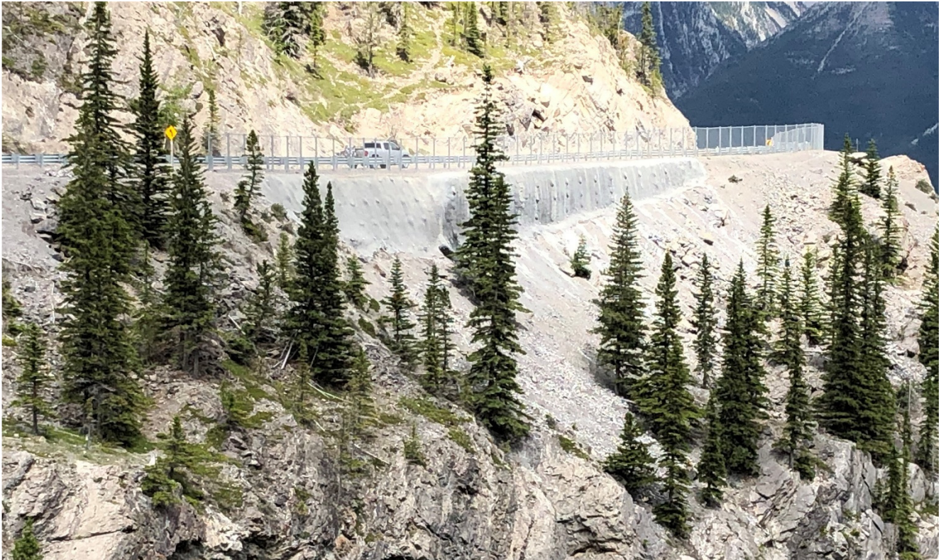
Photo 2 New guard rail barrier and chain link fence after completion of the gabion repairs. Photo taken facing northeast on July 6, 2020.