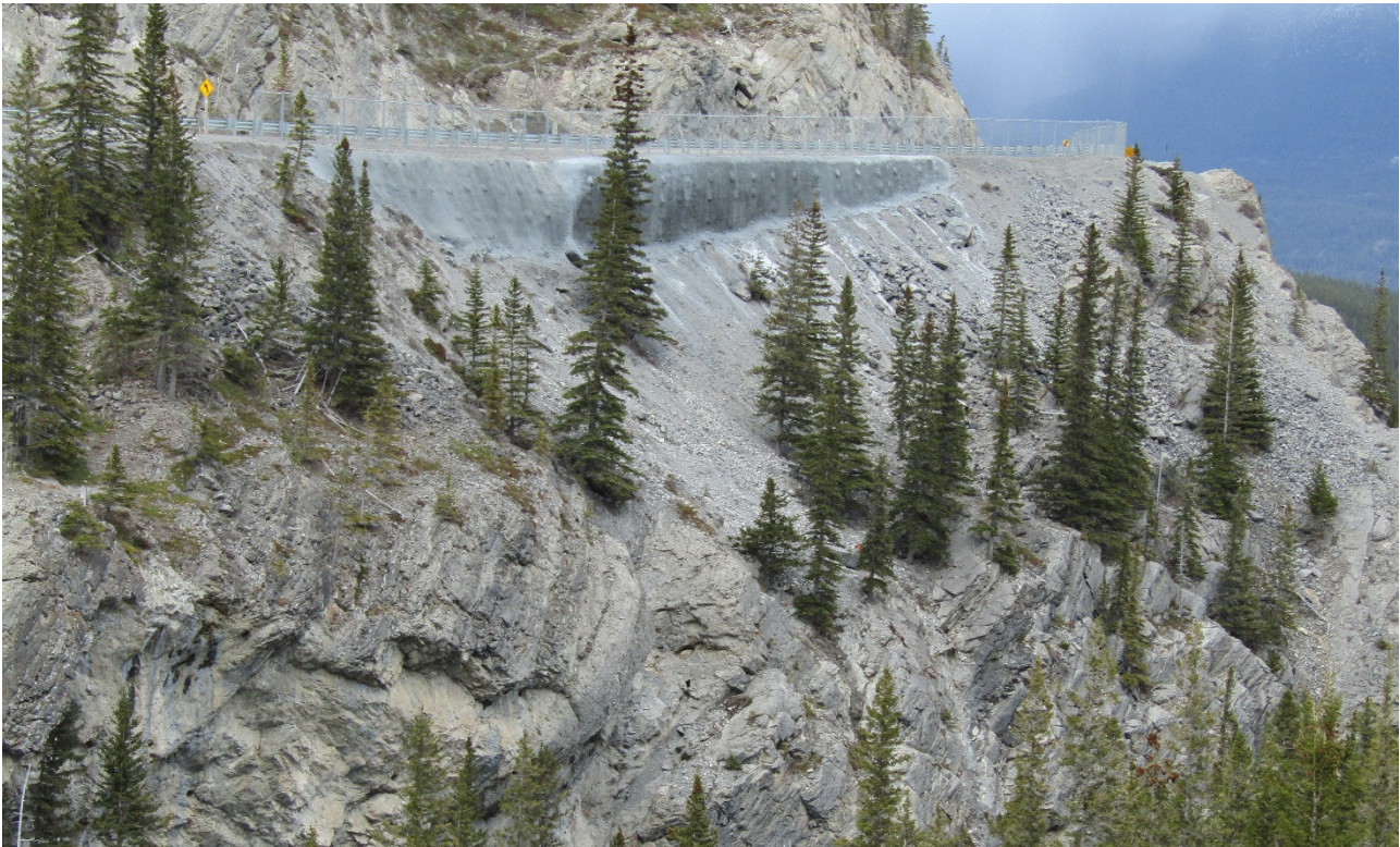
Photo 2 New guard rail barrier and chain link fence after completion of the gabion repairs. Photo taken facing northeast on May 7, 2019.