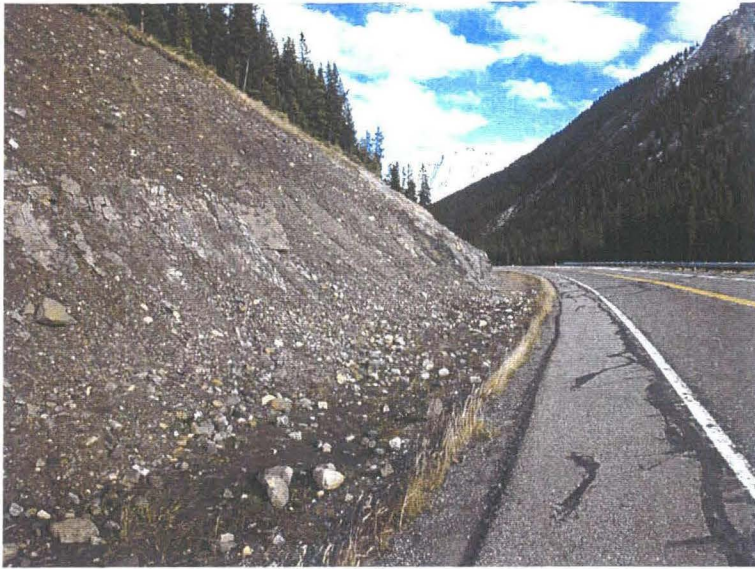
Photo 1 (top) – Facing southeast across the site. The northern end of the cut slope (visible in the foreground) exposes rocky soil at an angle of 45^\circ overlying a rock cut at about 60^\circ . Gullying of the exposed soil has released cobble to boulder-sized rocks and an apron of this debris has built up along the toe of this segment of the cut slope. Cobble to boulder-sized material has been deposited within 2 m of the edge of the pavement. The thickness of the exposed soil in the upper portion of the cut slope tapers out towards the southeast. The southeast end of the cut slope (in the background of this photo) exposes intact bedrock at an overall angle of 45^\circ with very little debris in the ditch below.