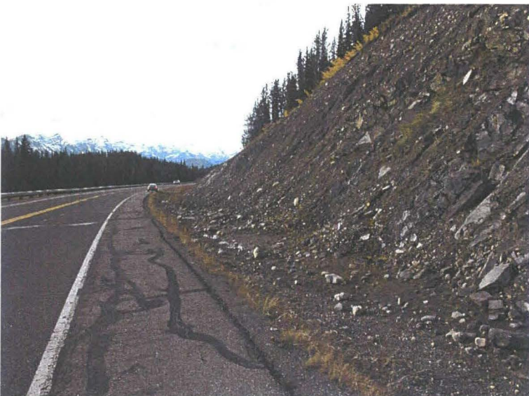
Photo 2 (middle) – Facing northwest across the northern end of the cut slope. Note the proximity of the debris in the ditch to the edge of the pavement.