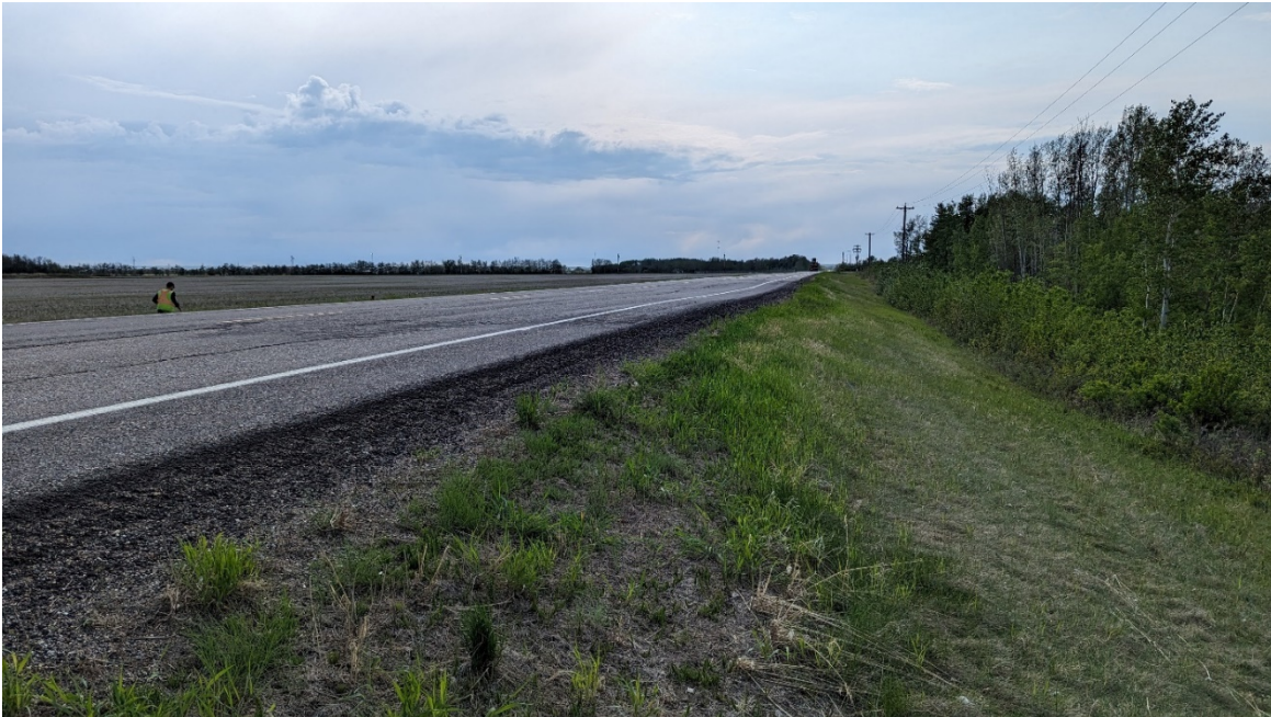
Photo 1 – Looking west over distressed area where dip is visible in the roadway surface.