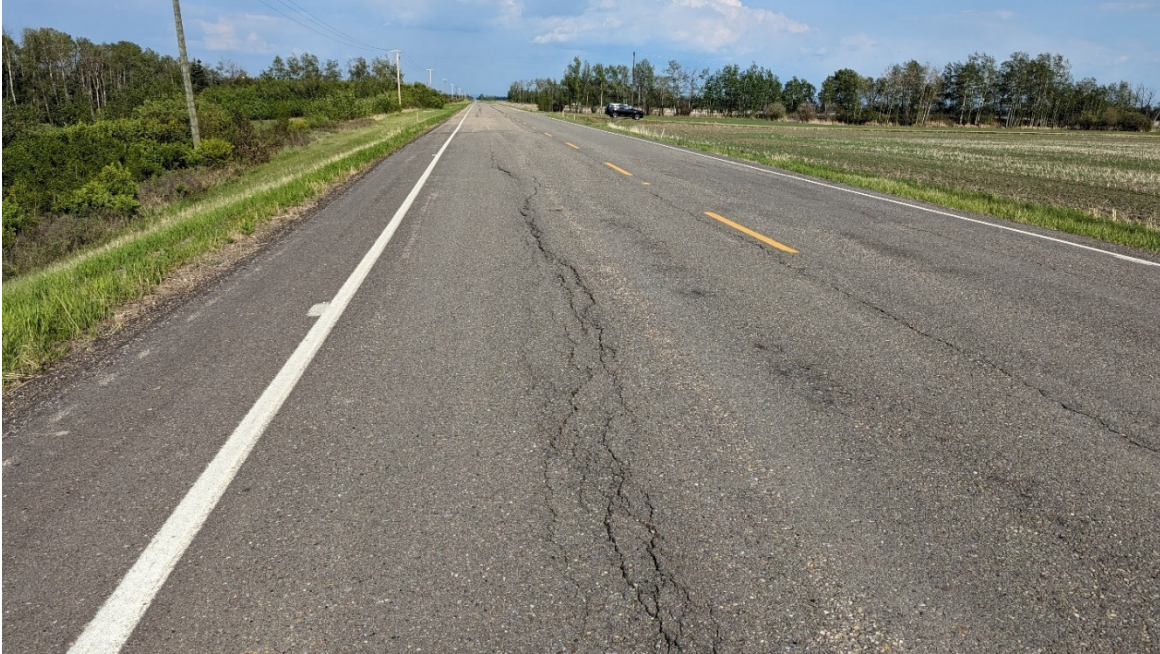
Photo 3 – Looking east at the central portion of the crack forming in the area of distress.