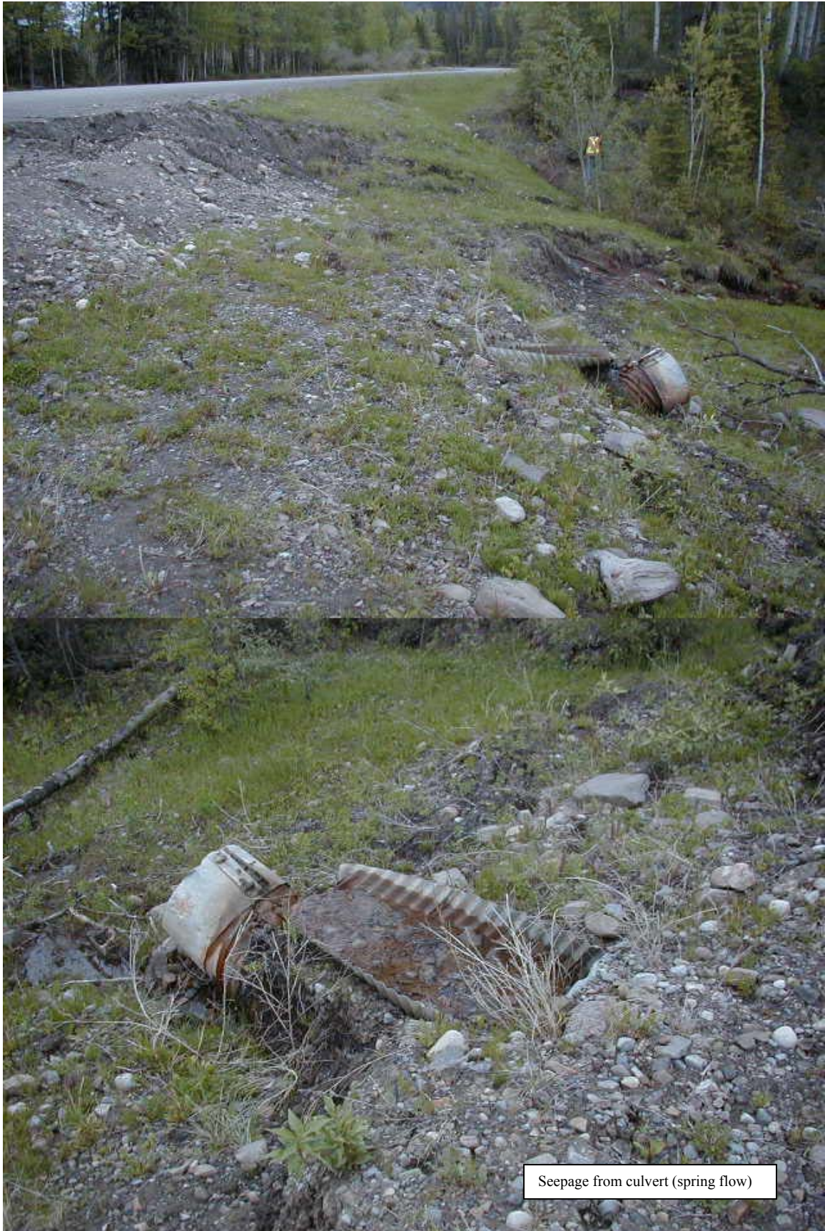
Seepage from culvert (spring flow)