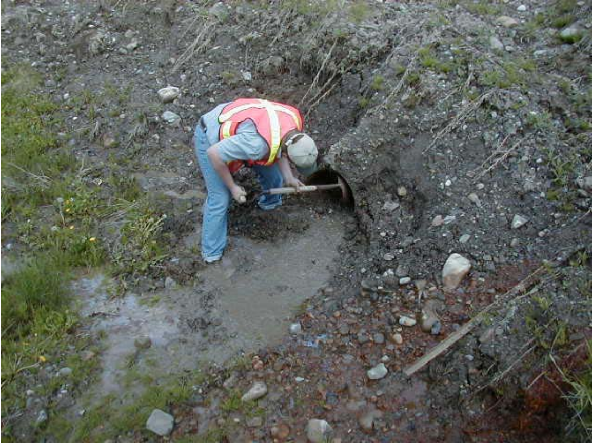
Removing blockage from end of pipe released a significant flow of water