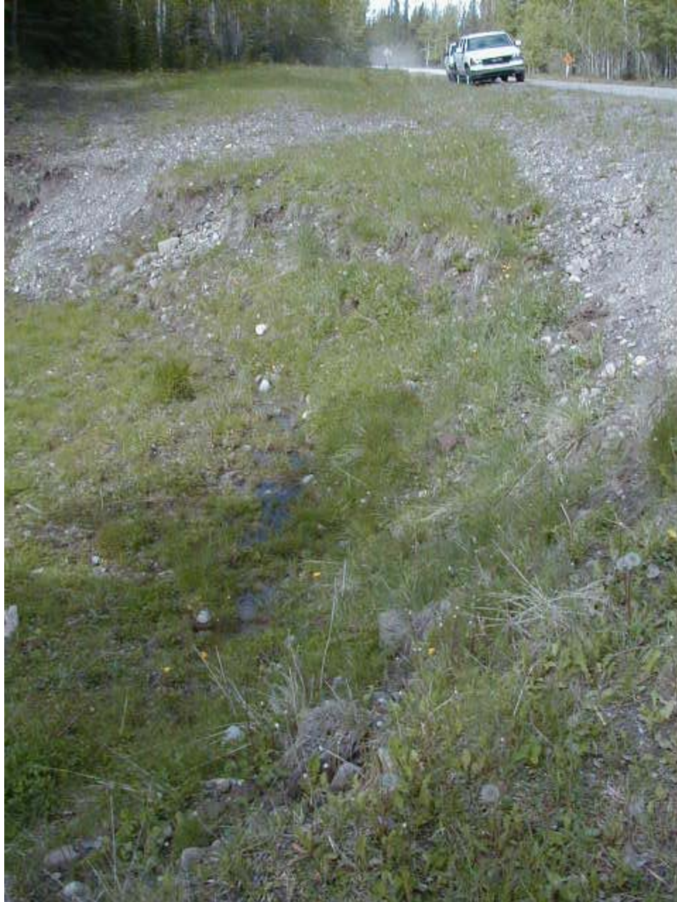
Looking south at Slide #2