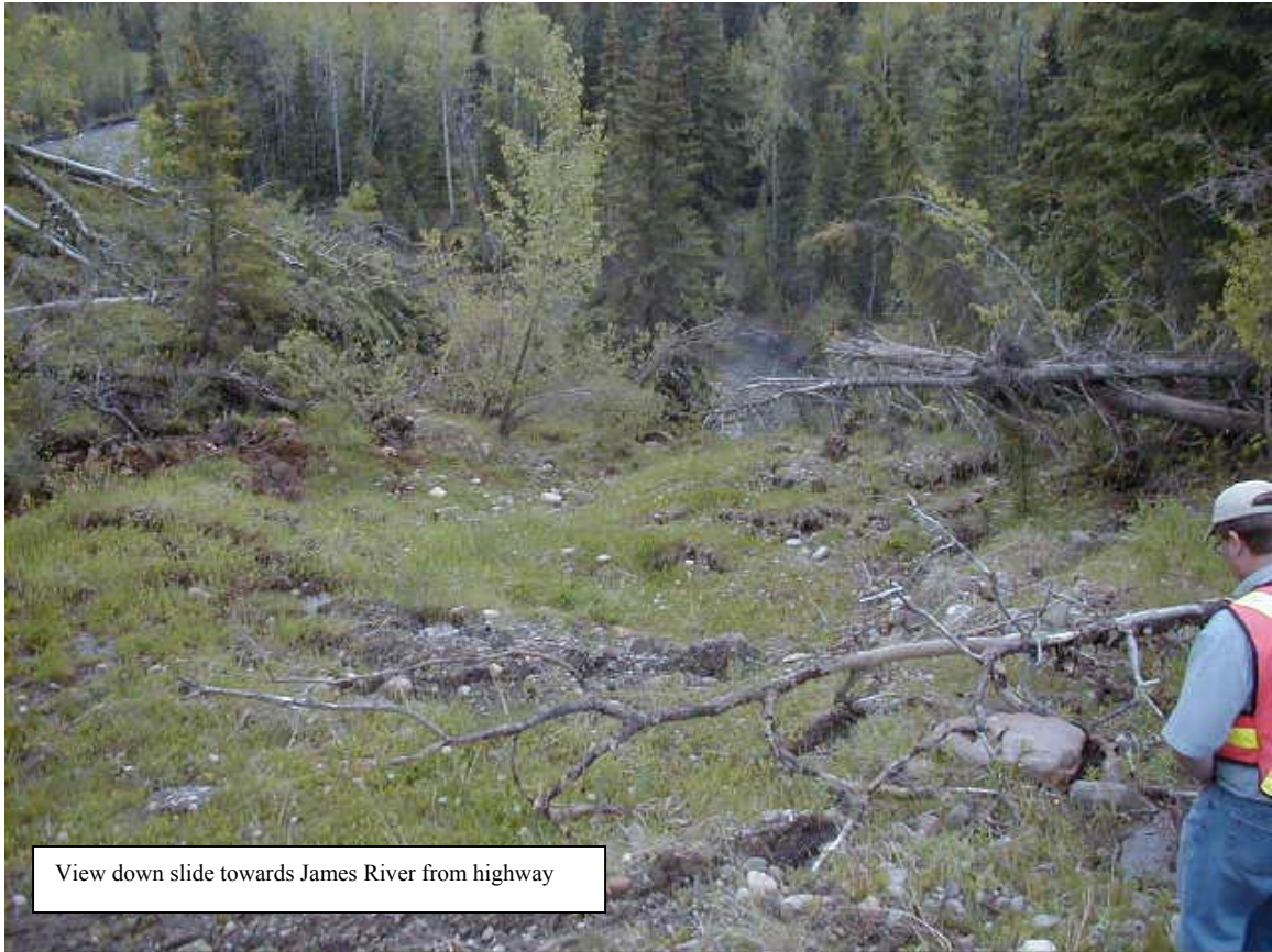
View down slide towards James River from highway