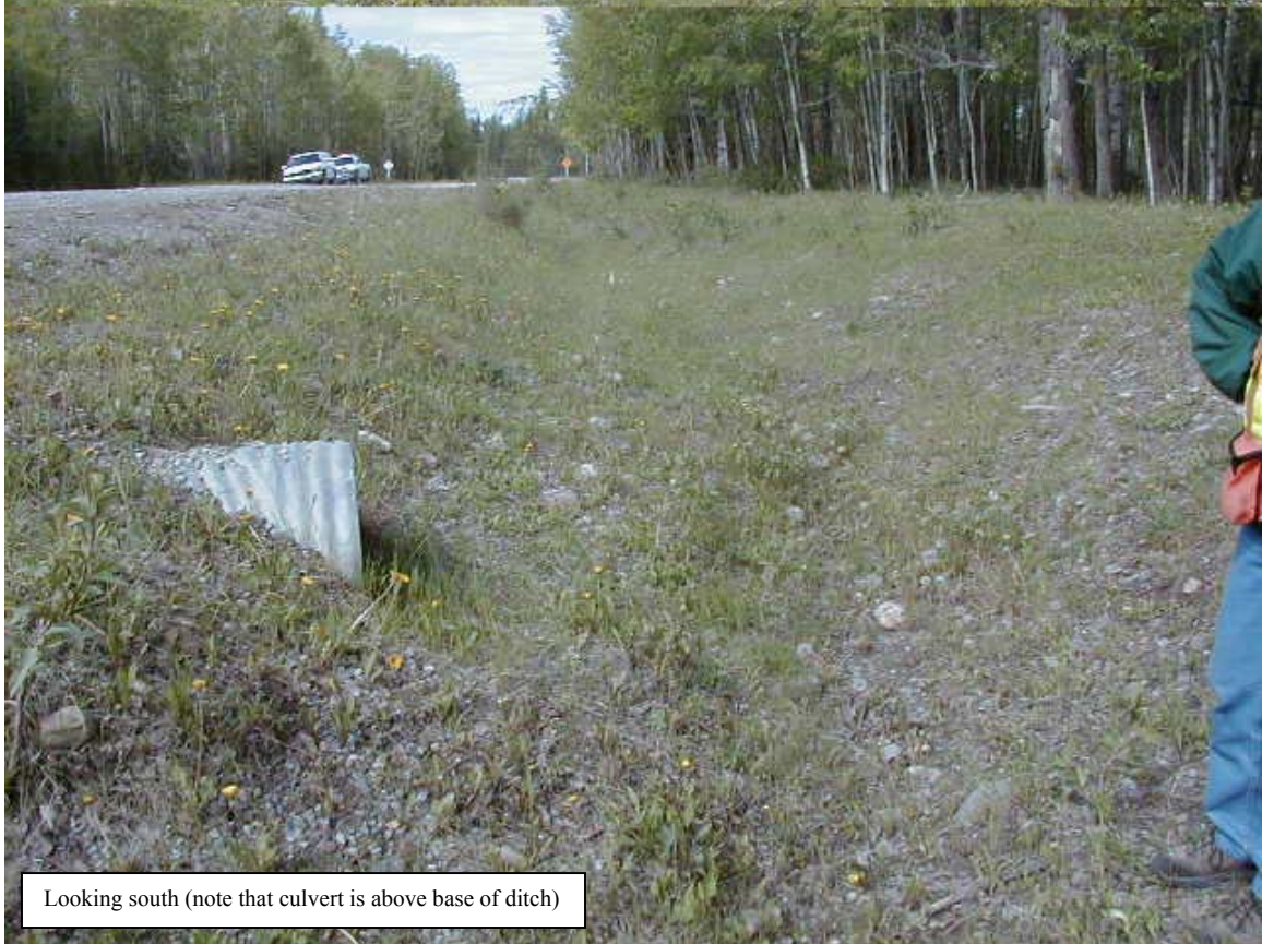
Looking south (note that culvert is above base of ditch)