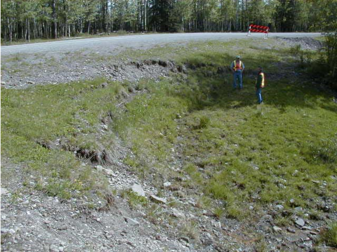
Slide #2 looking north