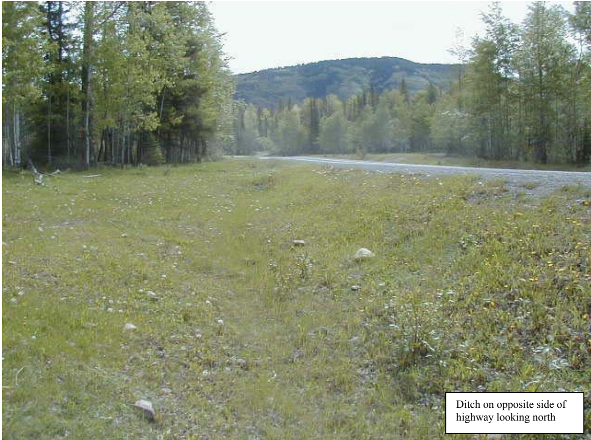
Ditch on opposite side of highway looking north