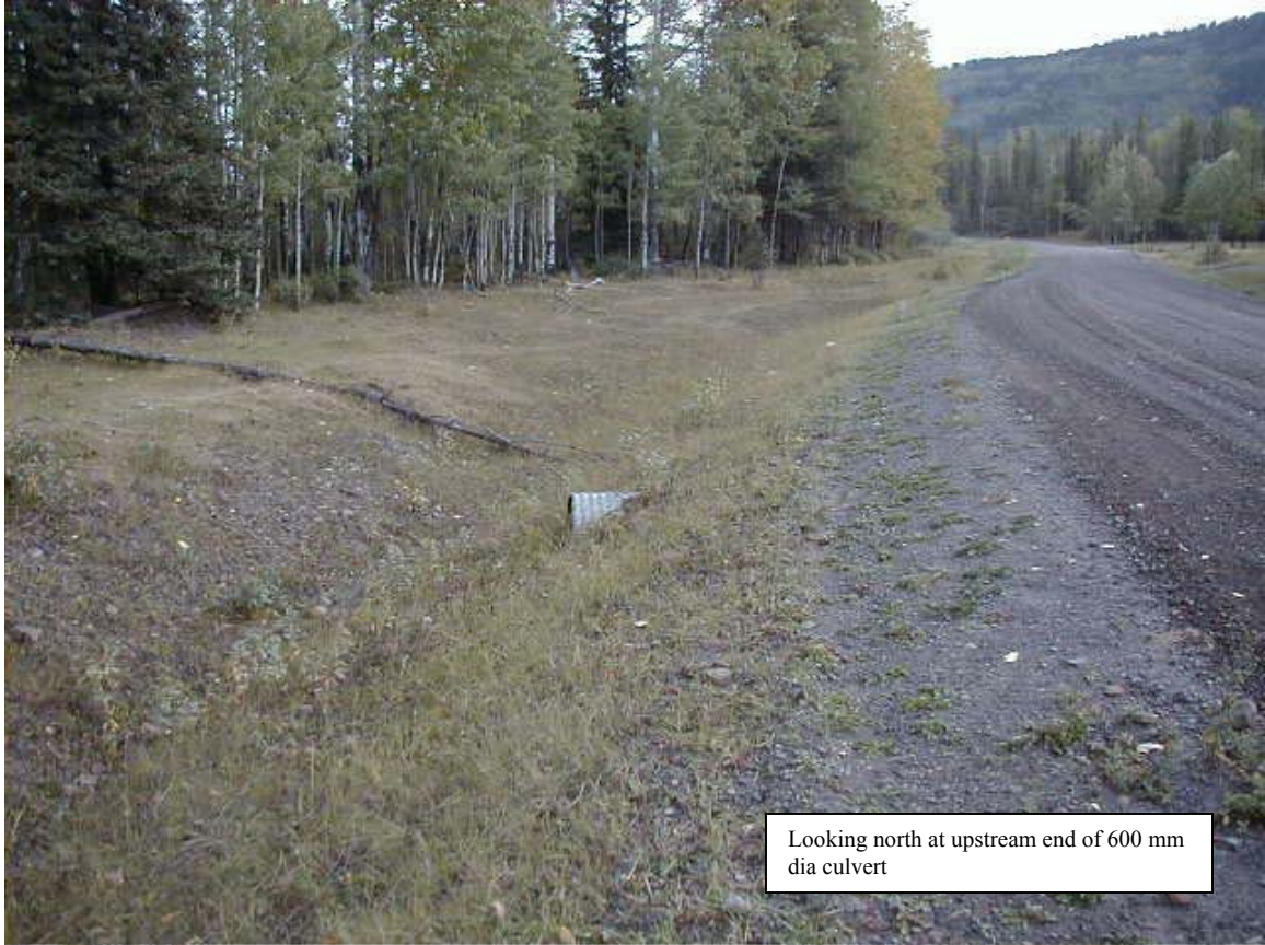
Looking north at upstream end of 600 mm dia culvert