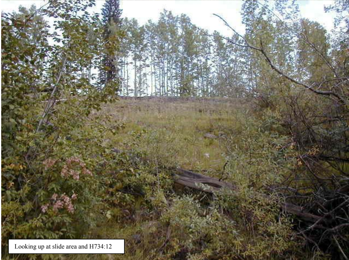
Looking up at slide area and H734:12