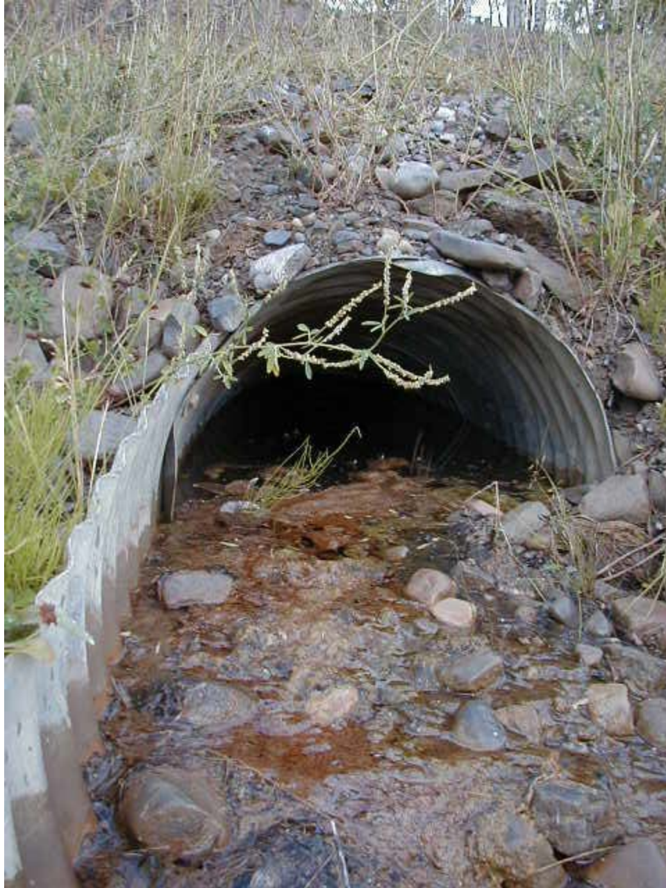
Outlet of 600 mm diameter CSP culvert damaged by slide. Water flow is from inside highway embankment (no inflow at upstream end).