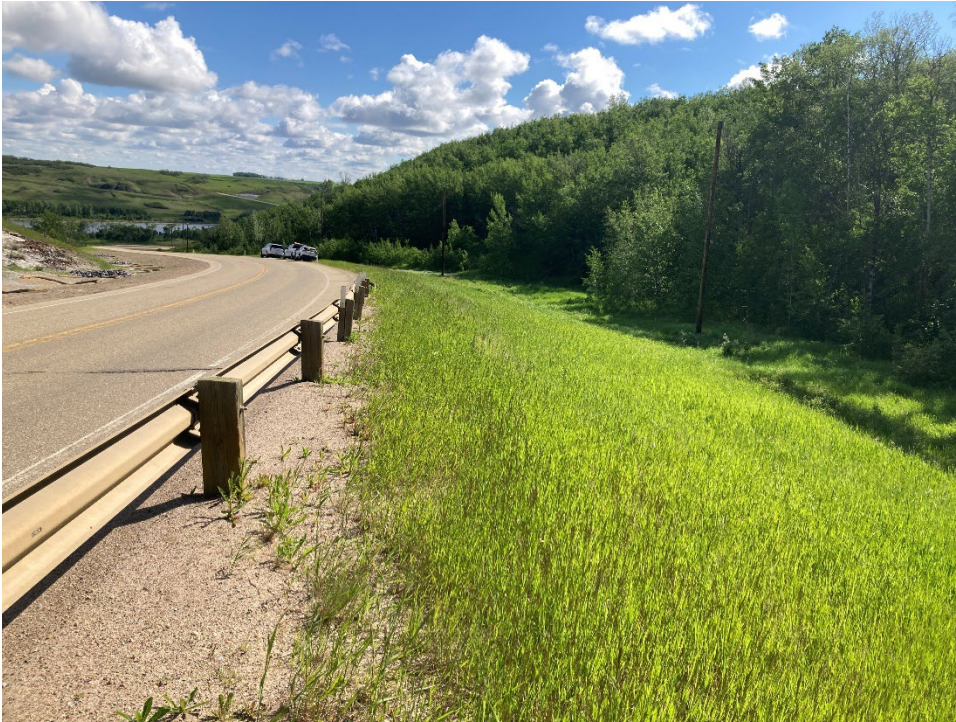
Photo 12 The south highway embankment slope and ditch is well vegetated and appears to be in good condition. Minor ditch erosion in ongoing but is not impacting the highway embankment. Photo taken June 17, 2024, facing west.