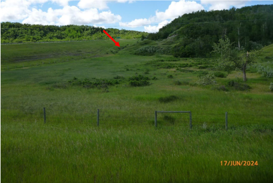
Photo 18 Erosion gully in the west (southbound) ditch along Hwy 56, north of the C075-2 site. Stake installed at upstream end indicated by red circle. Photo taken June 17, 2024, facing south.