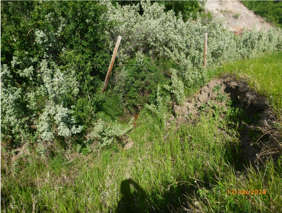
Photo 20 Erosion gully along the toe of the highway embankment (Hwy 609 and Driedmeat Lake in the background). Photo taken June 17, 2024, facing north.