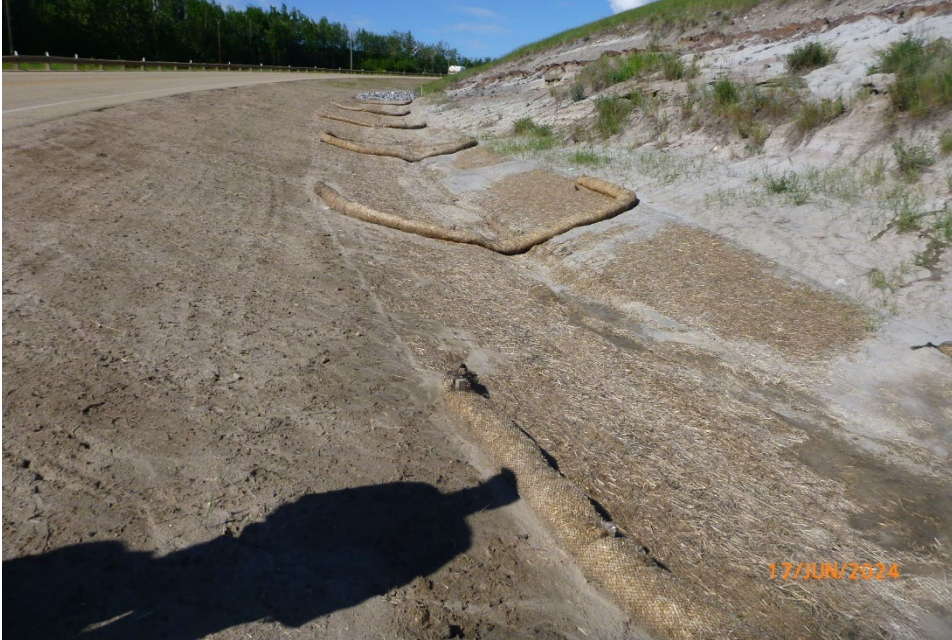
Photo 2 The RECP along portions of the repair is being undermined. Photo taken June 17, 2024, facing north.