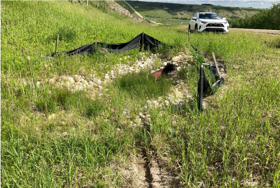
Photo 14 Outlet of culvert and riprap apron at the C075-2 site appears to be in good condition. Photo taken June 17, 2024, facing north.