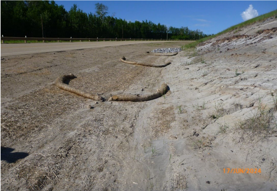
Photo 4 Sediment is accumulating behind the straw wattles. Photo taken June 17, 2024, facing west.