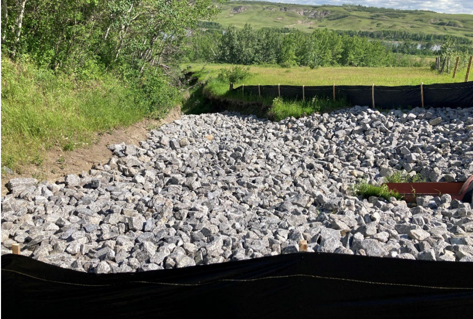
Photo 8 A large riprap apron (Class 1M) was installed in 2023. The riprap apron is over the previous apron and filled the large erosion gully downstream of the culvert outlet. Photo taken June 17, 2024, facing west.