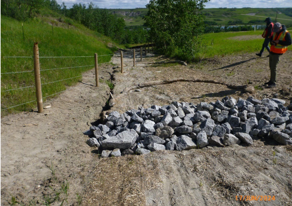
Photo 6 Plastic check dams were installed along the ditch repair, upstream (west) of the culvert outlet. Photo taken June 17, 2024, facing west.