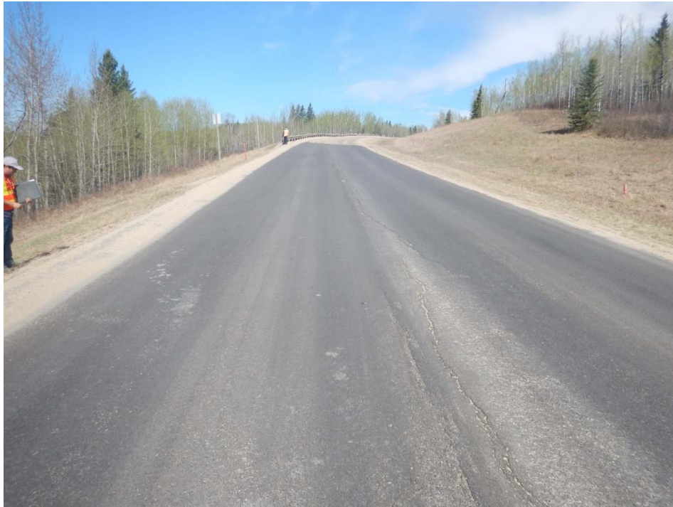
Photo No. 7 – Reflective Longitudinal Cracks at the Mid-Hill Slope Section (looking north)