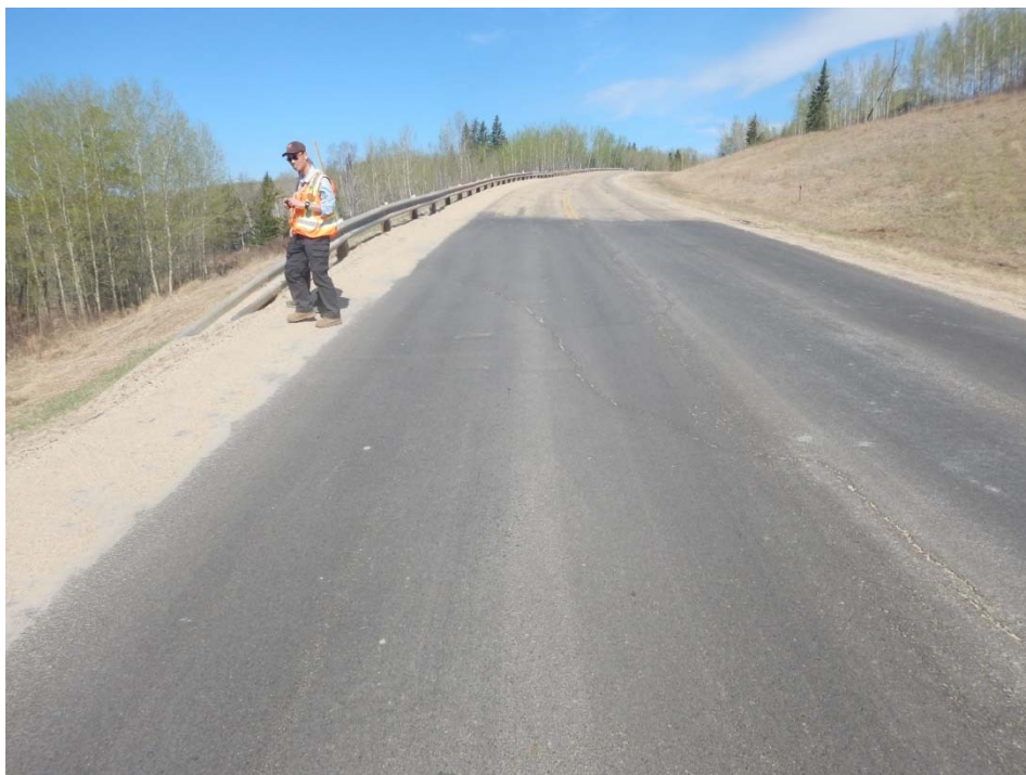
Photo No. 8 – Reflective Diagonal Crack at the north end of the Mid-Hill Slope Section