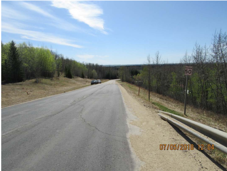
Photo No. 9 – Looking south at the patch from the northern limit of the Mid-Hill Slope Section