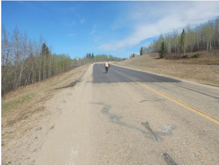
Photo No. 5 - Looking North at 2017 ACP Patch placed over the Mid-Hill Slope Section