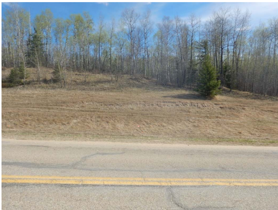
Photo No. 4 – Looking east at a vegetated scarp crack of a dormant slump within the highway backslope between the Mid-Hill and bottom of the hill slope sections