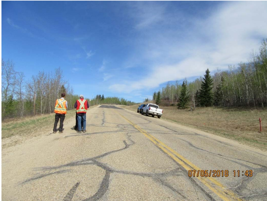
Photo No. 3 – Looking north at multiple open longitudinal cracks in the highway surface between the MH#1 location and the Mid-Hill slope section