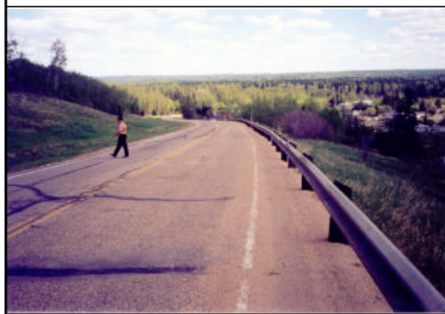
TOP OF HILL SH661